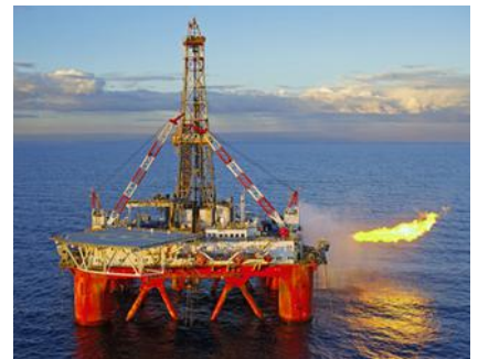
Off Shore Solutions