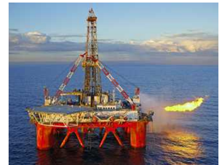
Off Shore Solutions

*10kVA *15kVA *20kVA *30kVA *40kVA *60kVA *80kVA *100kVA *120kVA *160kVA *200kVA *250kVA *300kVA *400kVA *500kVA *600kVA *800kVA