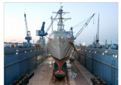
Planes Ground Units

*3kVA * 6kVA *10kVA *20kVA *30kVA *40kVA *60kVA *80kVA *100kVA *120kVA *160kVA *200kVA *250kVA *300kVA *400kVA *500kVA *600kVA *800kVA