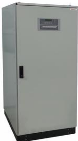
20 kVA Frequency Converter

*3kVA * 6kVA *10kVA *20kVA *30kVA *40kVA *60kVA *80kVA *100kVA *120kVA *160kVA *200kVA *250kVA *300kVA *400kVA *500kVA *600kVA *800kVA