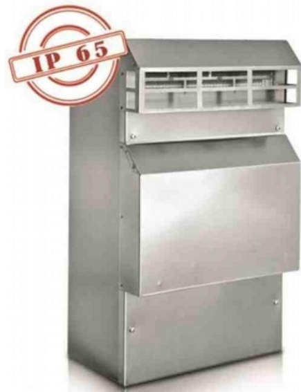
Optional Air Conditioner For IP55 and IP65